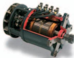
Shunt or series wound motors with carbon brushes and collectors

Using high-performance frequency inverters, we succeeded at the beginning of the 1990s in economically converting direct current into 3-phase alternating current. This has enabled us to utilise the advantages of 3-phase AC technology for electric fork lifts. Disposing of collectors and carbon brushes, along with the associated enclosure of the motor, has opened up new areas of application for electric fork lifts as well as significantly reducing operating costs. Consequently, we now equip all classes of fork lift with 3-phase AC technology.