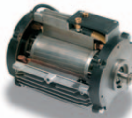
3-phase AC motor completely enclosed, no wearing parts