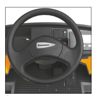
Clear layout of controls ensures