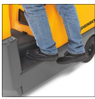
Ergonomic low step for effortless entry and exit