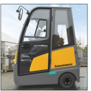
Driver cabs also available if required