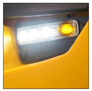
Reliable LED lighting (optional)