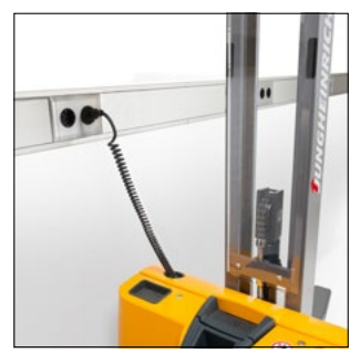
Easy charging at any 230 V mains socket thanks to built-in charger