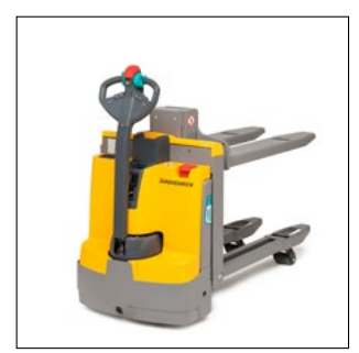
Short mast of the EMD 115i for ergonomic order picking up to a height of 690 mm