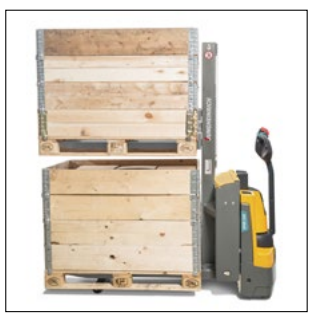
Double-deck operation: Loading of two pallets one above the other