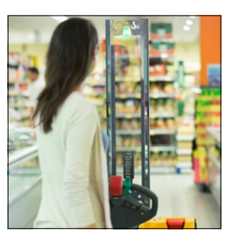
Optimum view of the forks and surrounding areas