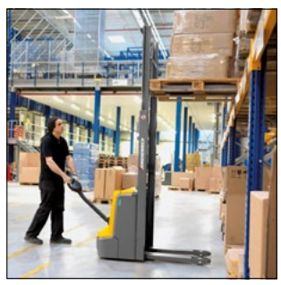
Excellent view of the load for precise positioning